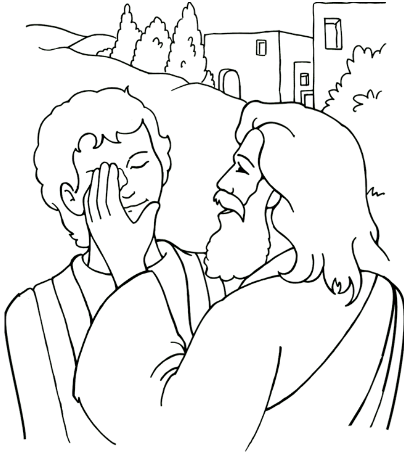
Jesus heals a blind man. John 9

From Thru-the-Bible Coloring Pages for Ages 4-8. © 1986, 1988 Standard Publishing. Used by permission. Reproducible Coloring Books may be purchased from Standard Publishing, www.standardpub.com , 1-800-543-1301.