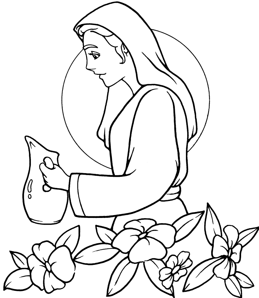
A Bride for Isaac Genesis 24:1-67

Copyright © CalvaryCurriculum.com Used by Permission