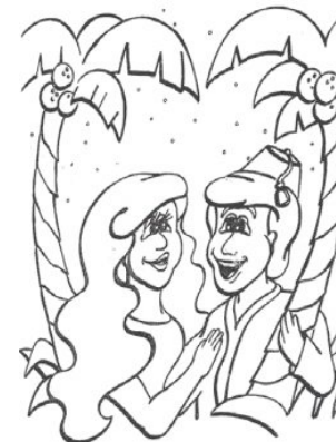
Isaac and Rebekah