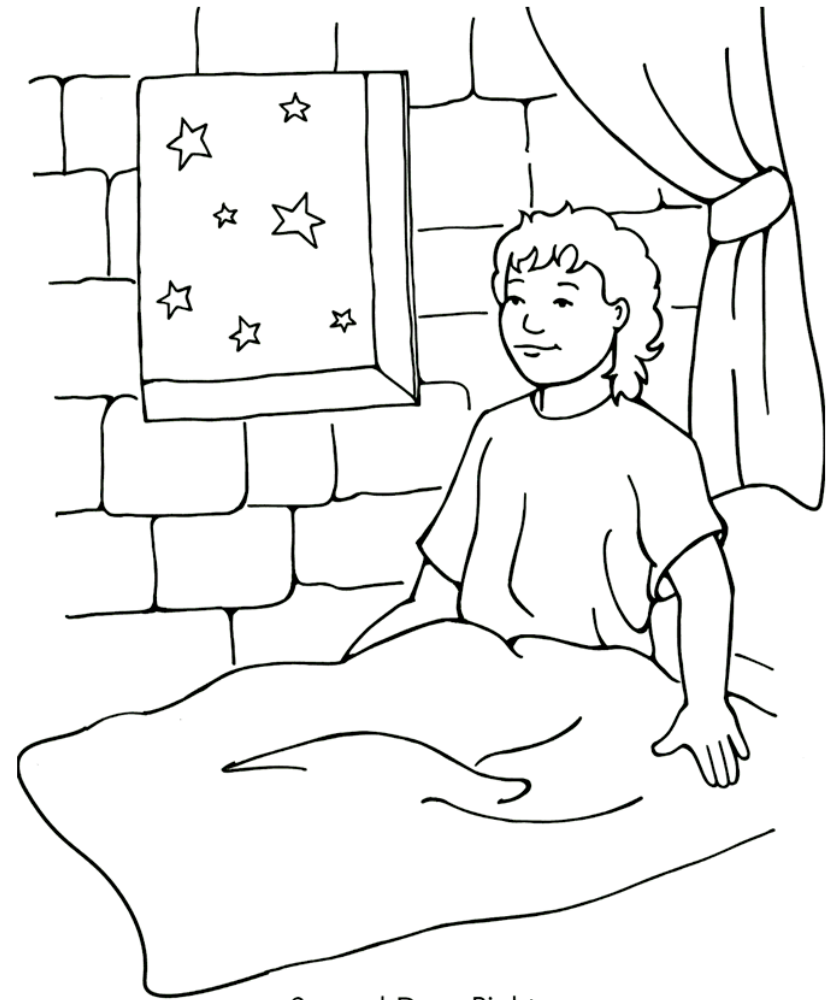
Samuel Does Right 1 Samuel 2-4, 7