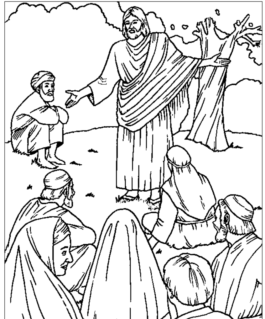
The Sermon on the Mount Matthew 5:1-12

From BibleStoryCard Learning System(tm) Coloring Book © 1996 Wesleyan Publishing House. Used by permission. Additional BibleStoryCard resources are available by calling 1-800-493-7539 or visiting online http://www.wesleyan.org/941/biblestorycards