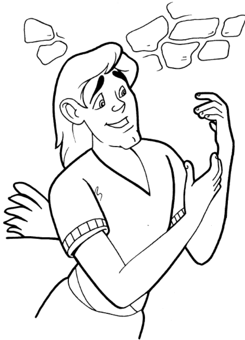
Jesus Heals a Withered Hand Mark 3:1-6