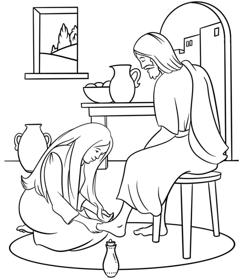
Mary Anoints Jesus' Feet John 12:1-8

Then Mary took about a pint of pure nard, an expensive perfume; she poured it on Jesus' feet and wiped his feet with her hair. John 12:3a (NIV)