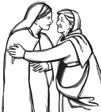
Mary Visits Elizabeth