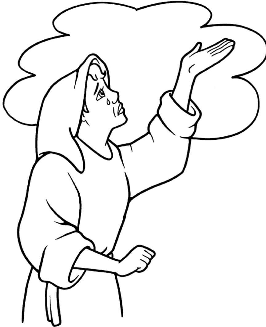
Hannah wept and prayed to the LORD. 1 Samuel 1:10

Choose the word that best matches the definition.