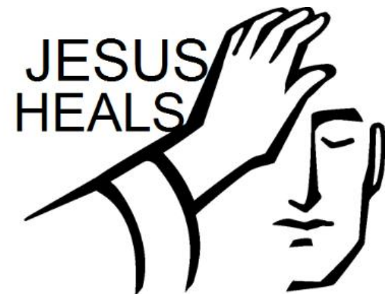
Jesus Heals a Blind Man Mark 10:46-51