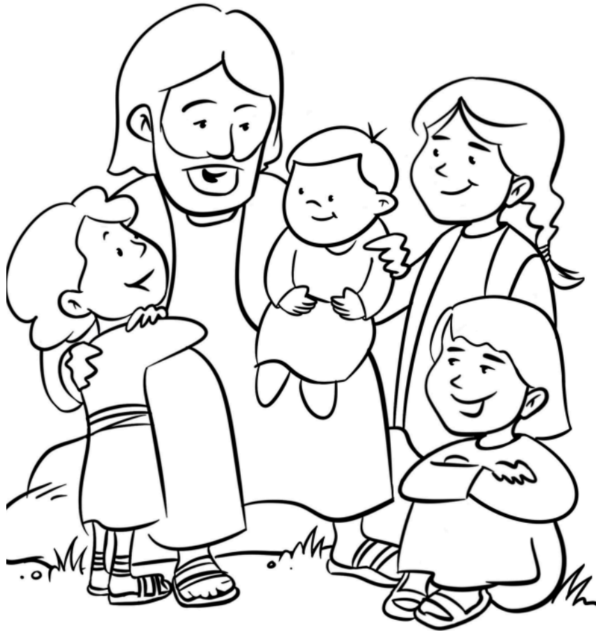
Jesus and the Children

Each number represents a letter of the alphabet. Substitute the correct letter for the numbers to reveal the coded words.