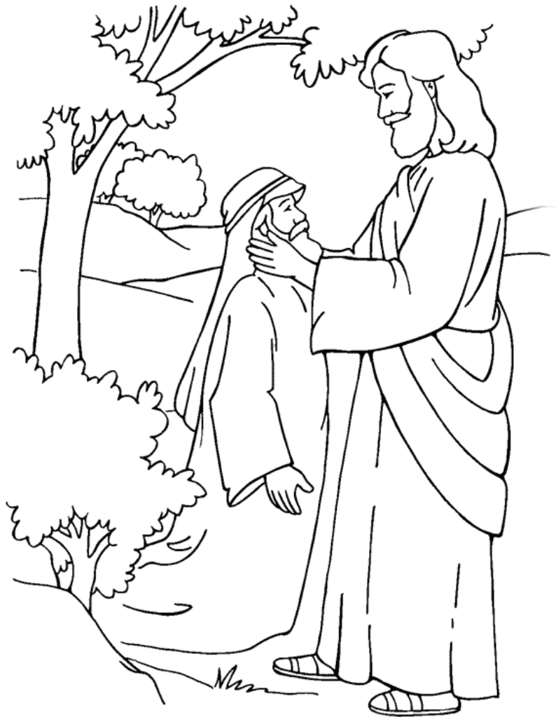
Jesus Heals a Deaf Man Mark 7:31-37

From Thru-the-Bible Coloring Pages © Standard Publishing. Used by permission. Reproducible Coloring Books may be purchased