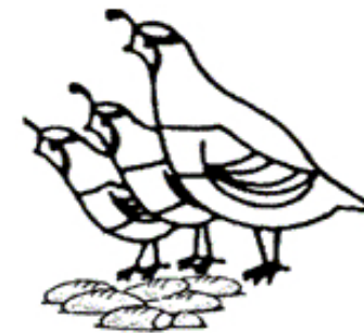
Manna & Quail

Moses said to them, "It is the bread that the LORD has given you to eat." Exodus 16:15