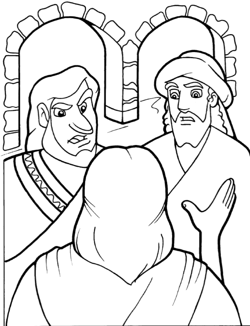
Jesus said to them, "Only in his hometown, among his relatives and in his own house is a prophet without honor." Mark 6:4 (NIV)