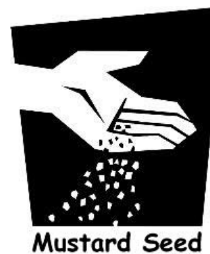
The Parable of the Mustard Seed Mark 4:30-34