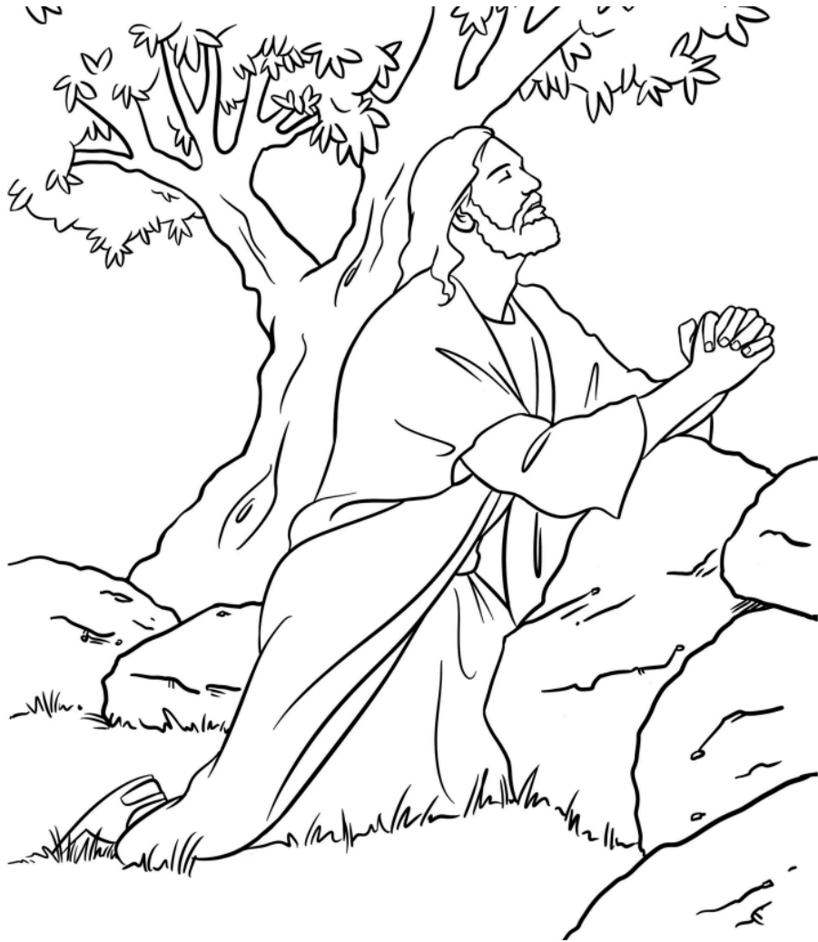
Jesus Prays for His Disciples