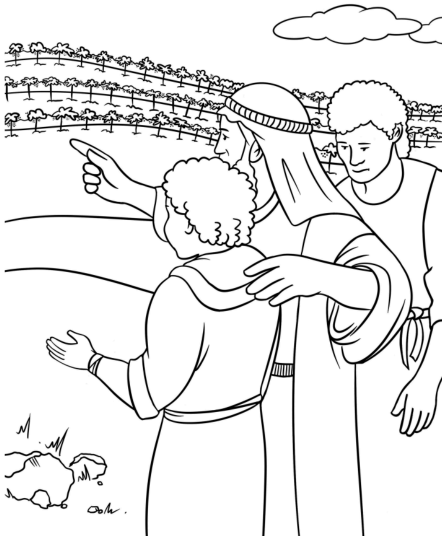
The Parable of the Two Sons Matthew 21:28-30

You can find the answers in Matthew 21:28-30 (NIV)