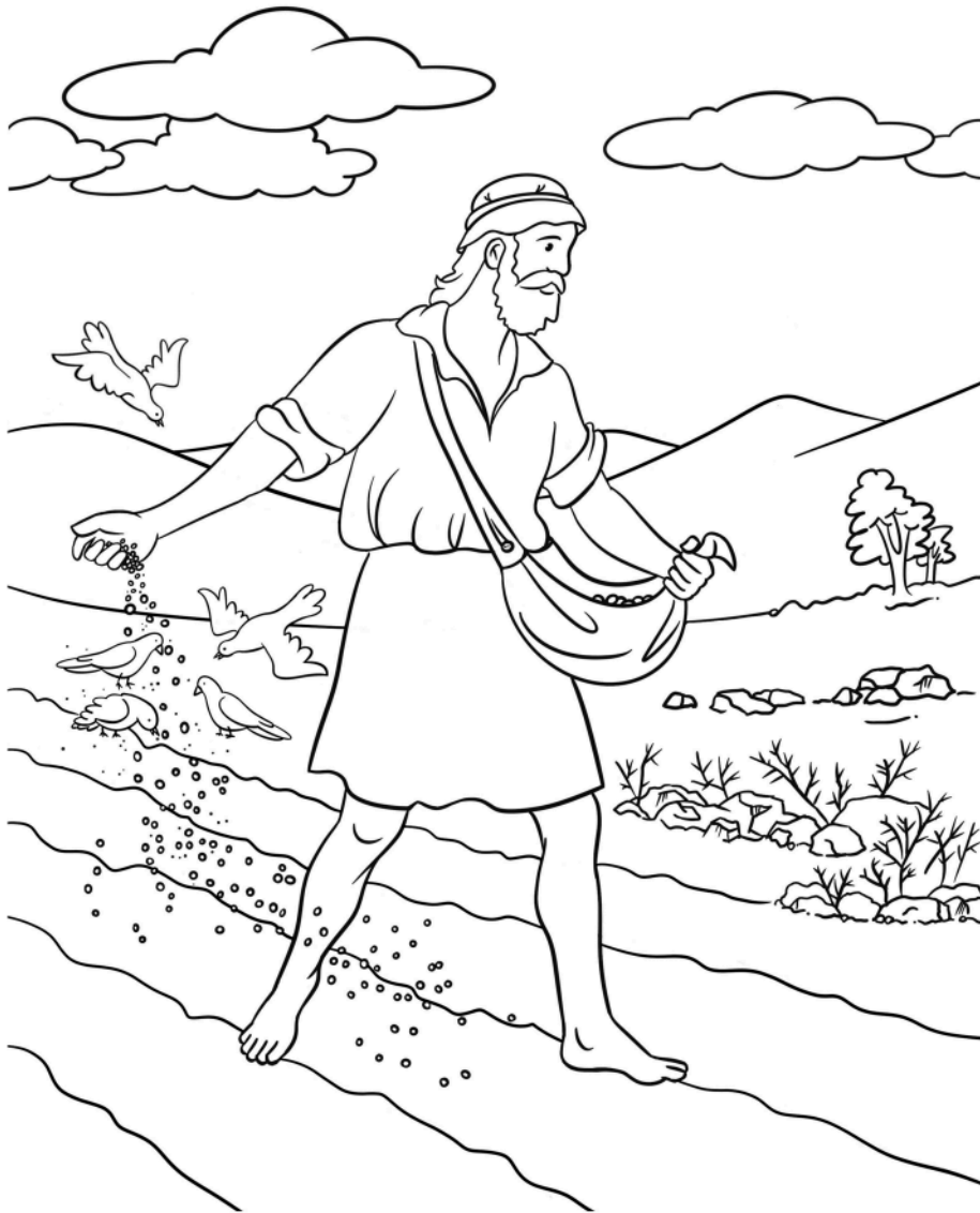
The Parable of the Sower

Choose the word that best matches the definition.