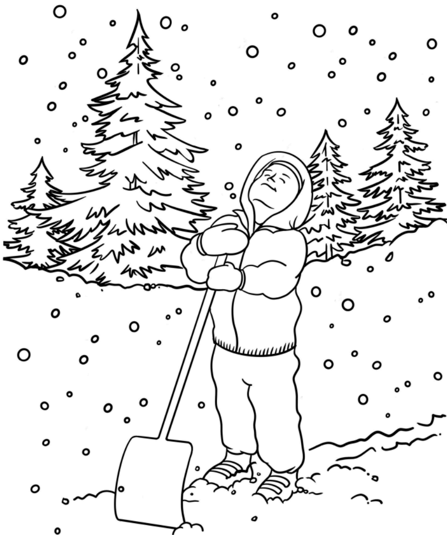
God Helps Me

Each number represents a letter of the alphabet. Substitute the correct letter for the numbers to reveal the coded words.