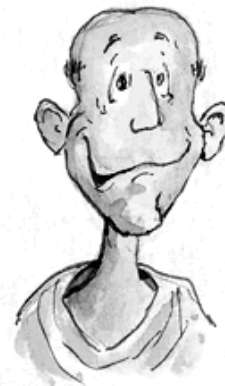
Zacchaeus