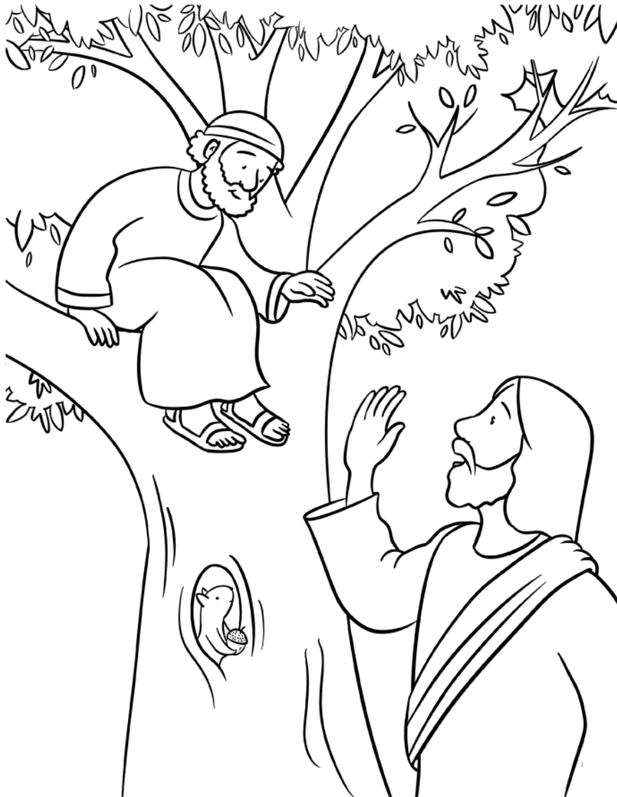
Jesus and Zacchaeus Luke 19