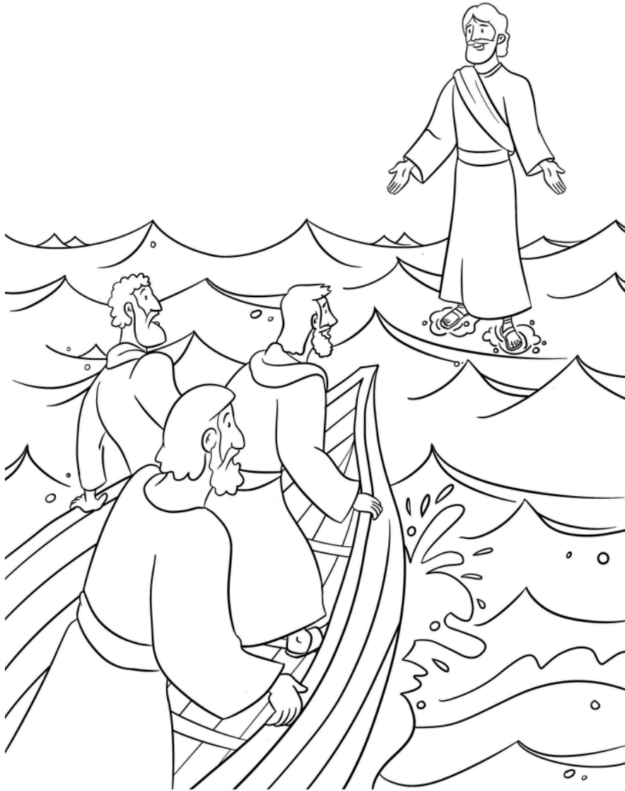
Jesus Walks on Water