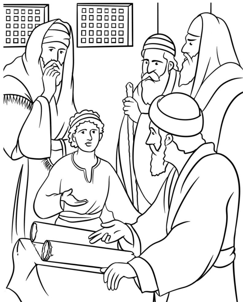
Jesus in the Temple Luke 2

Can you help Mary and Joseph find Jesus in the Temple?