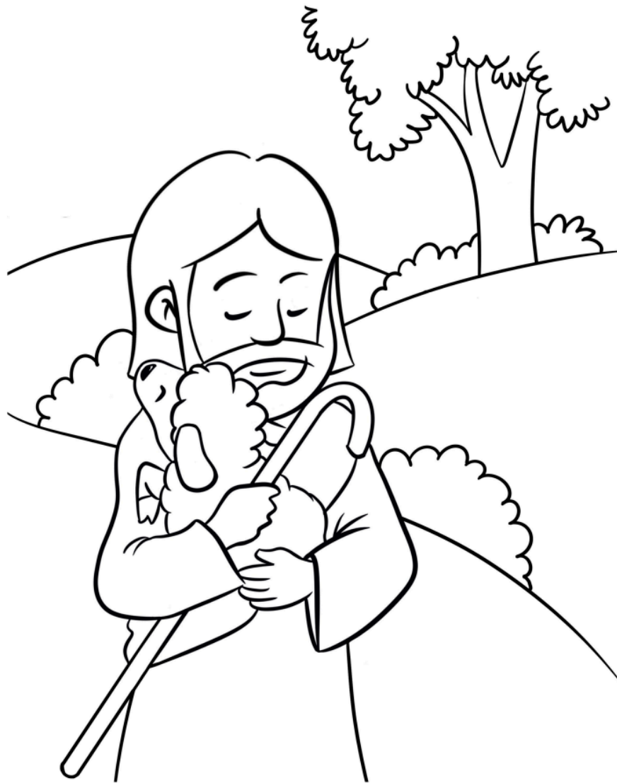
The Parable of the Lost Sheep

Each number represents a letter of the alphabet. Substitute the correct letter for the numbers to reveal the coded words.