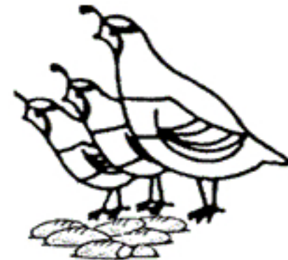
Manna & Quail

Moses said to them, "It is the bread that the LORD has given you to eat." Exodus 16:15