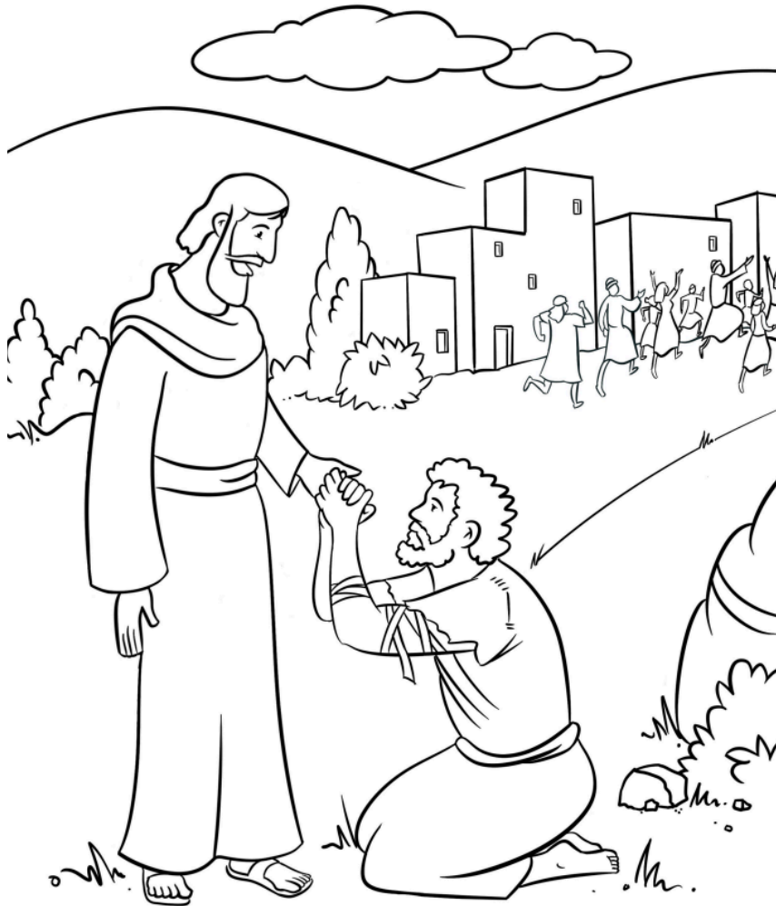
The Ten Lepers Luke 17:11-19