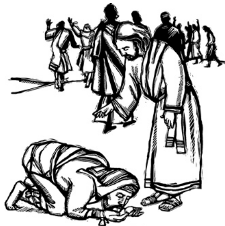
Jesus Heals 10 Lepers