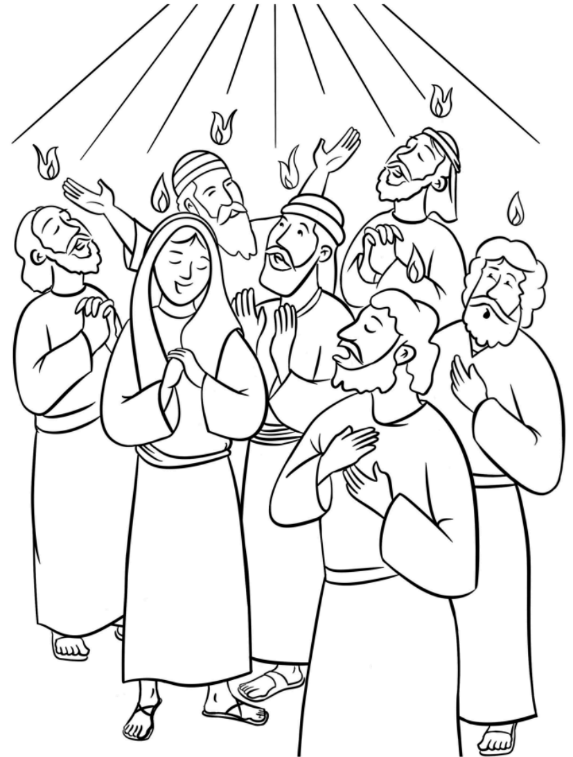
The Day of Pentecost Acts 2