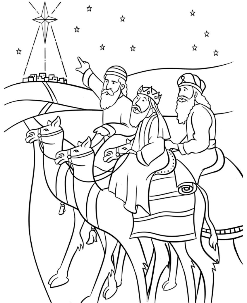
Wise Men Worship Jesus Matthew 2