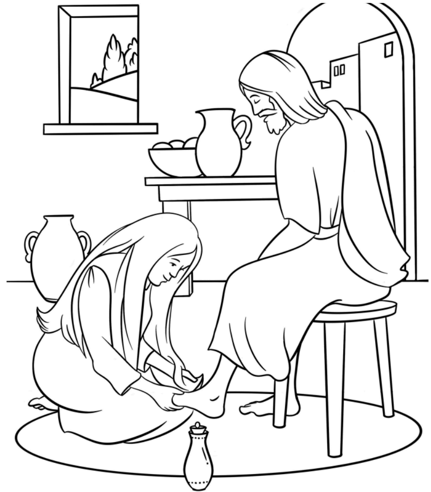
Mary Anoints Jesus' Feet John 12:1-8

Then Mary took about a pint of pure nard, an expensive perfume; she poured it on Jesus' feet and wiped his feet with her hair. John 12:3a (NIV)