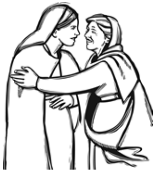
Mary Visits Elizabeth