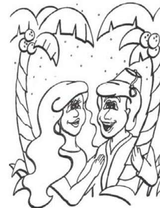
Isaac and Rebekah