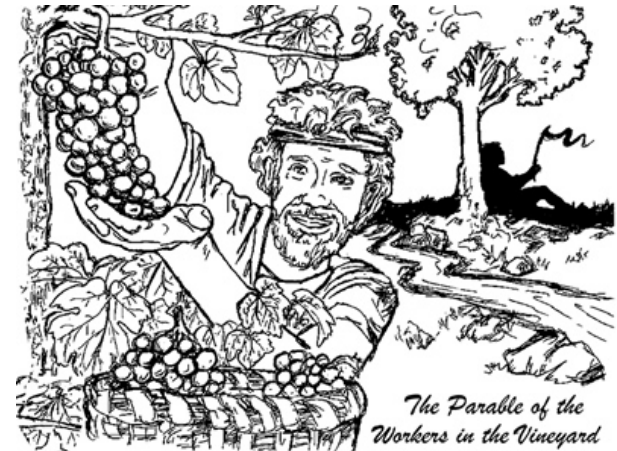
The Parable of the Workers in the Vineyard