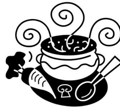
Esau Sells His Birthright to Jacob Genesis 25:19-34

Copyright ©Sermons4Kids | All Rights Reserved | www.sermons4kids.com