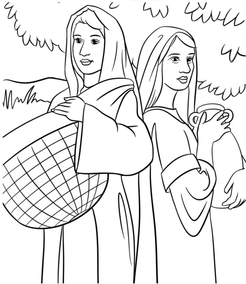
Leah and Rachel

Now Laban had two daughters; the name of the older was Leah, and the name of the younger was Rachel.