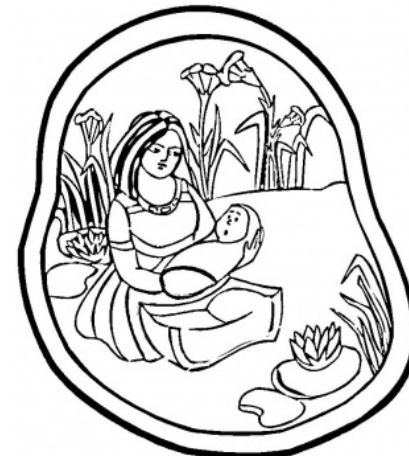
The Baby Moses by the River