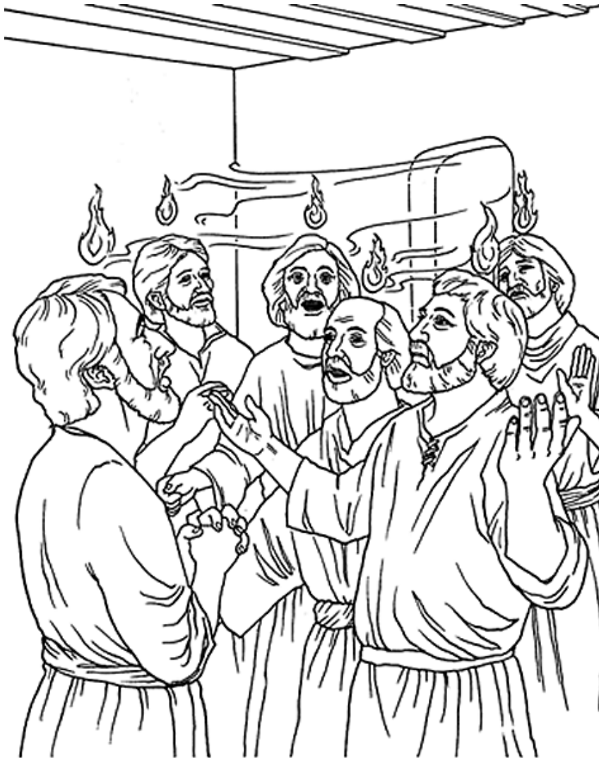
The Day of Pentecost

Unscramble each word and then place the numbered letters in the numbered boxes at the bottom to reveal the answer.