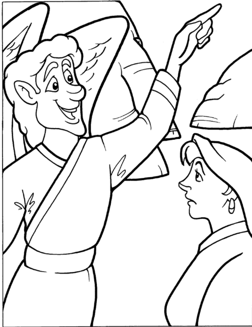
Jesus Is Alive!

Each number represents a letter of the alphabet. Substitute the correct letter for the numbers to reveal the coded words.