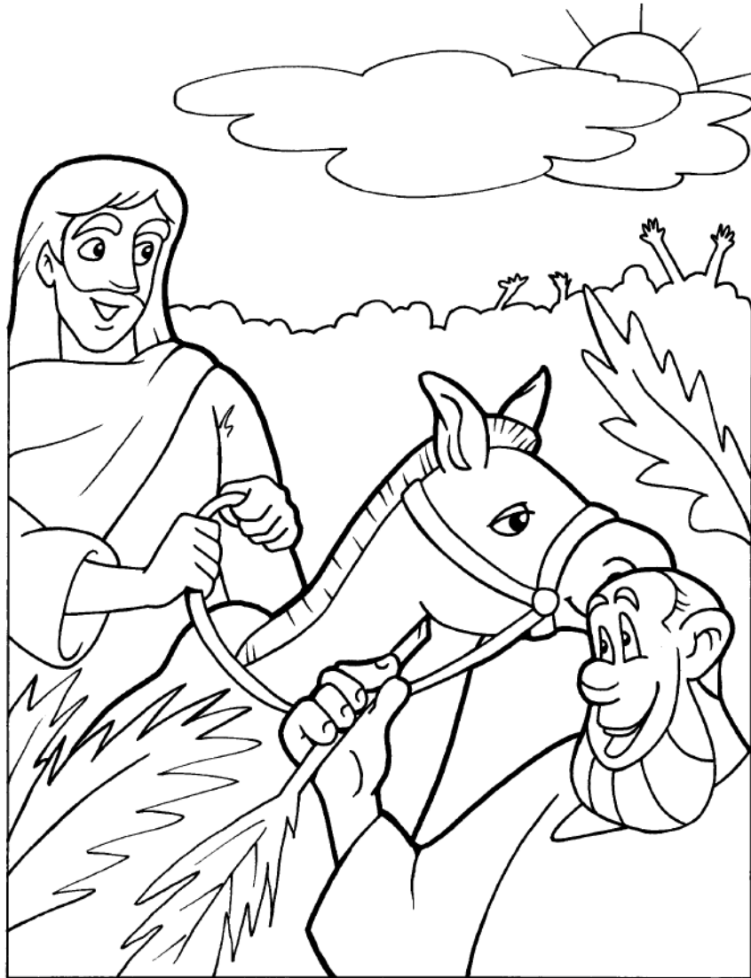
The Triumphal Entry

Can you help Jesus find the way through the streets of Jerusalem to the temple?