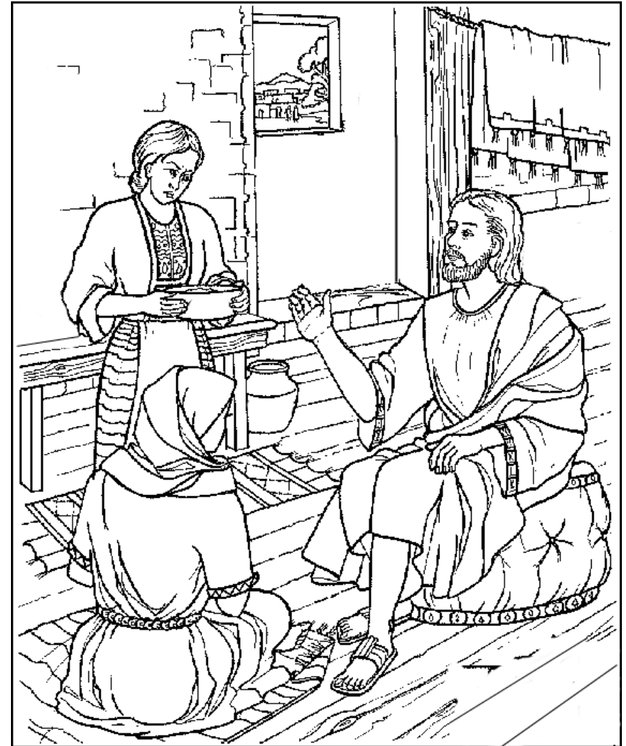
Jesus visits the home of Mary and Martha. Luke 10:38:42