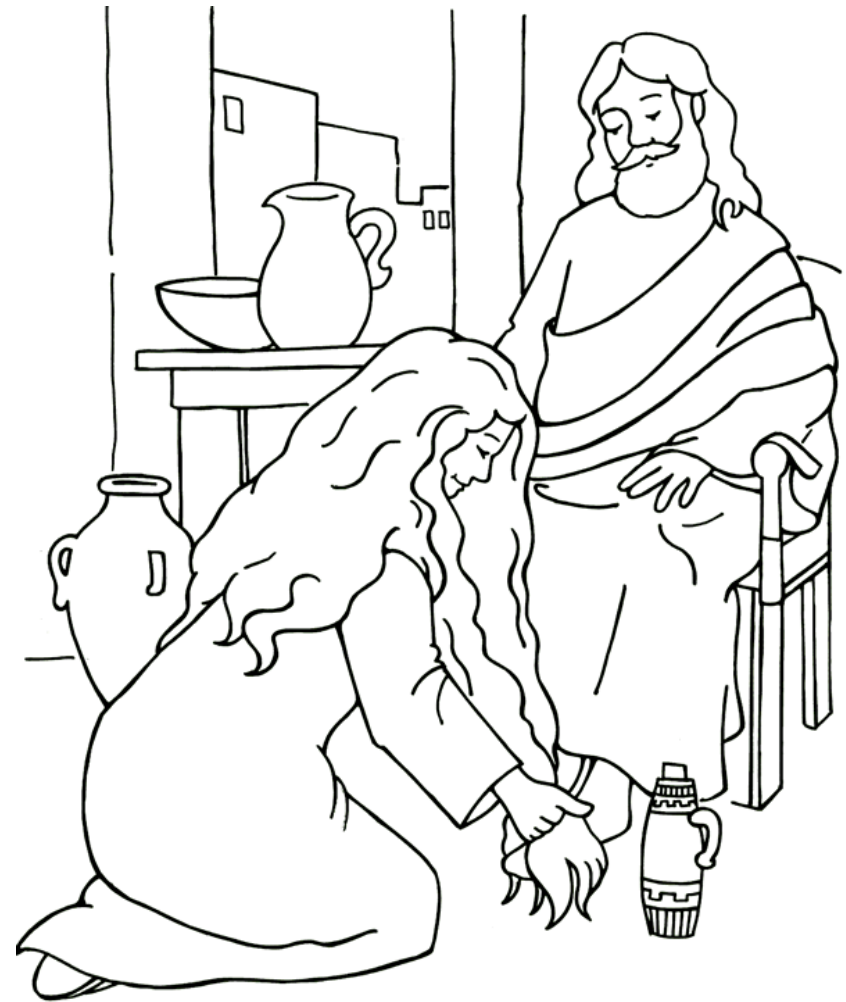
Jesus Forgives a Woman Luke 7