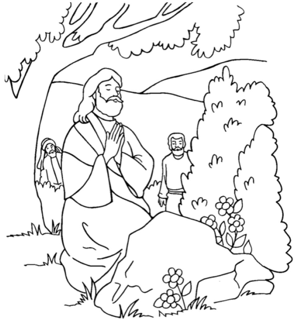
Jesus Prays in a Solitary Place

From Thru-the-Bible Coloring Pages © 1986,1988 Standard Publishing. Used by permission. Reproducible Coloring Books may be purchased from Standard Publishing, www.standardpub.com , 1-800-543-1301.