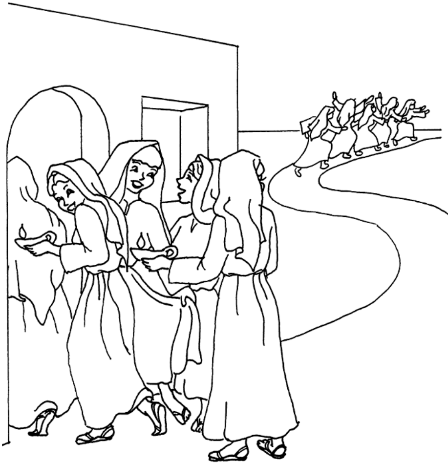
The Parable of the Ten Bridesmaids Matthew 25:1-13