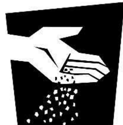
The Parable of the Mustard Seed and the Yeast Matthew 13:31-33