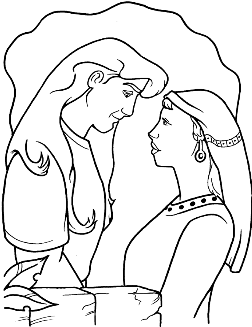
Samson and Delilah