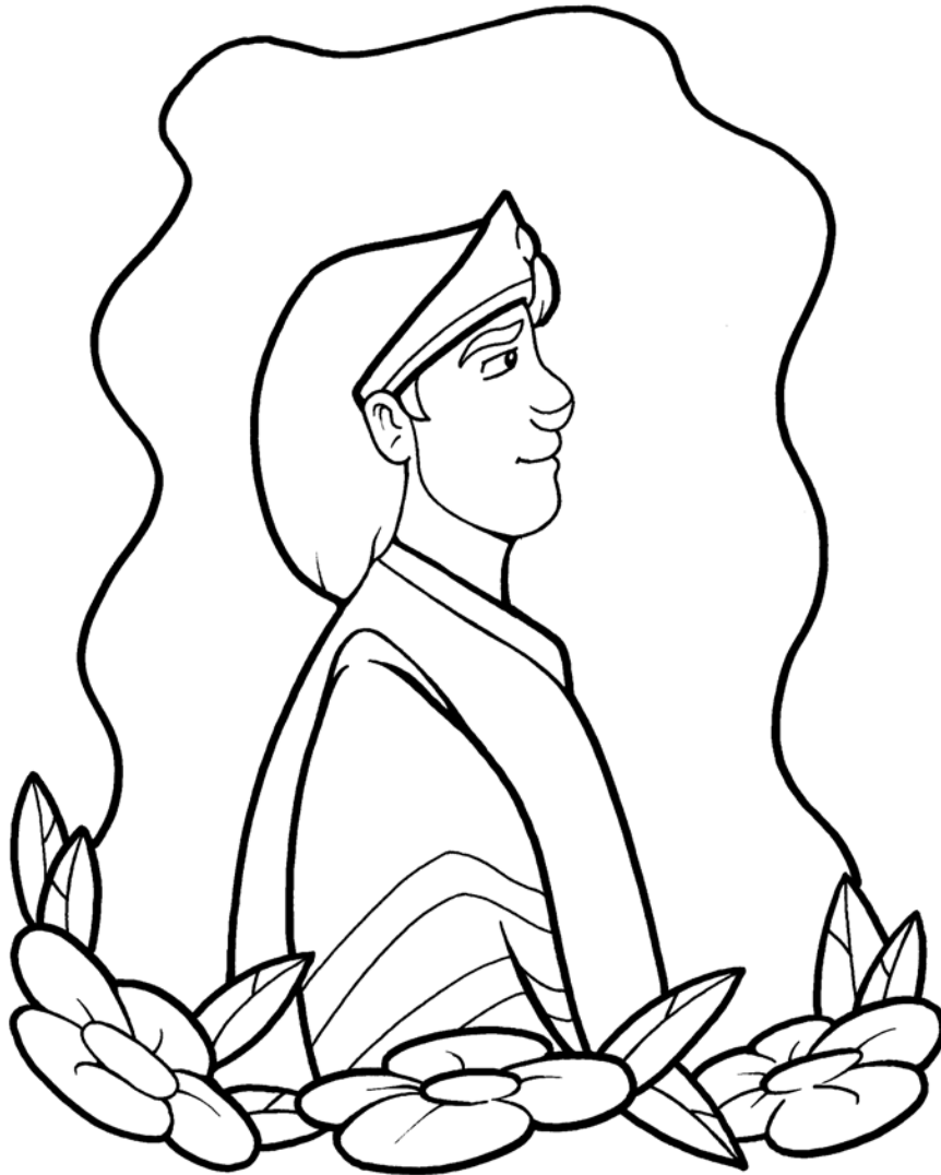
David, King of Israel