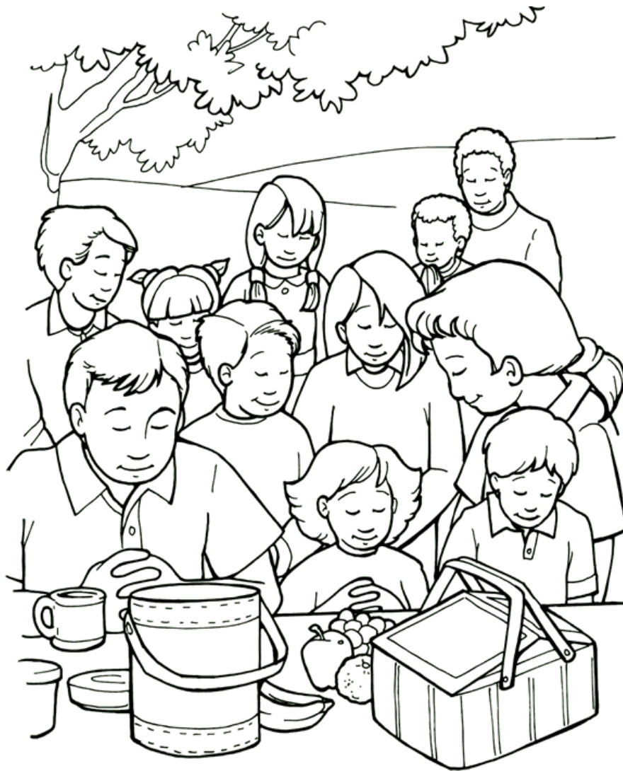
Jesus can feed a crowd with a little food.

From Thru-the-Bible Coloring Pages for Ages 4-8. © Standard Publishing. Used by permission. Reproducible Coloring Books may be purchased from Standard Publishing, www.standardpub.com , 1-800-543-1301.