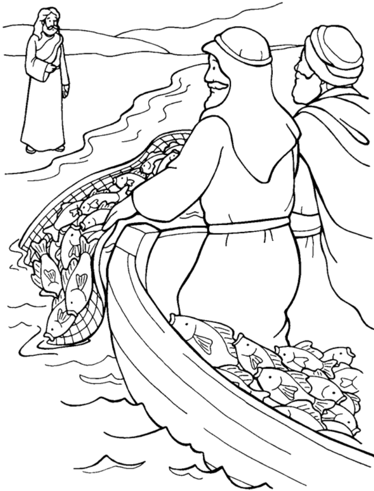
Jesus calls four of his disciples.

From Thru-the-Bible Coloring Pages for Ages 4-8. © 1986,1988 Standard Publishing. Used by permission. Reproducible Coloring Books may be purchased from Standard Publishing, www.standardpub.com , 1-800-543-1301.