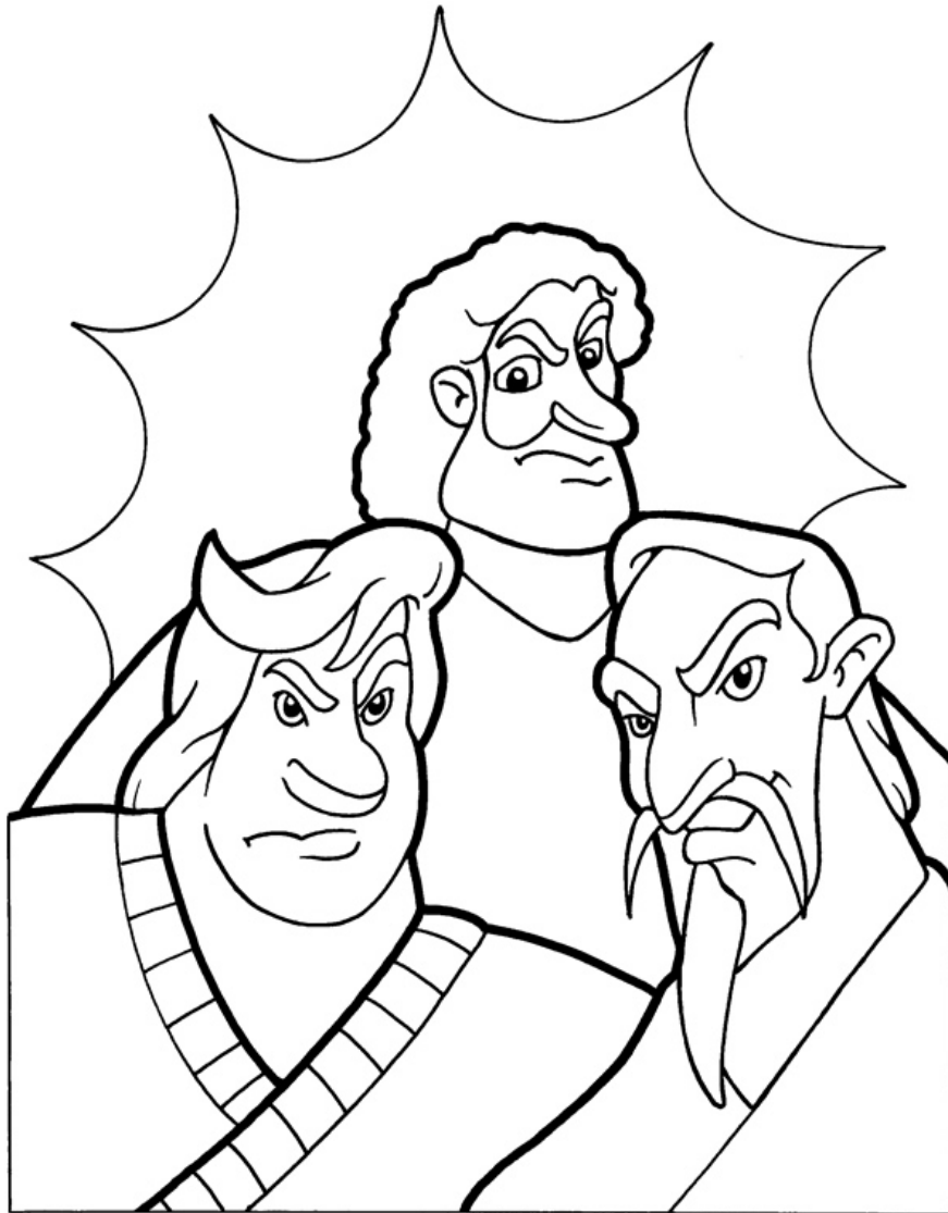
The Parable of the Tenants Matthew 21:33-46

Copyright © CalvaryCurriculum.com Used by Permission