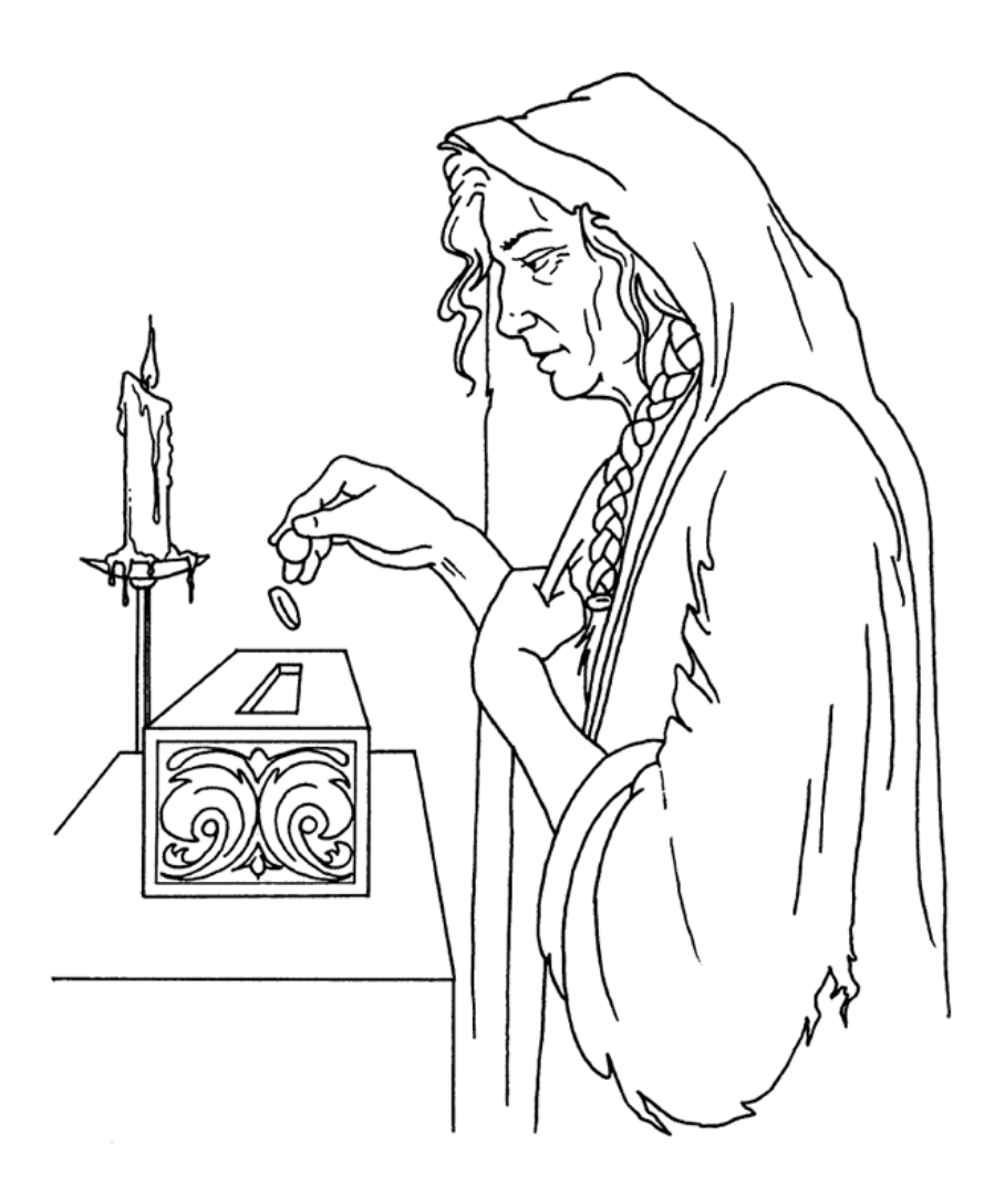
The Widow's Mite