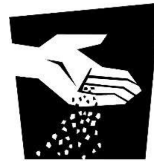
Mustard Seed Faith