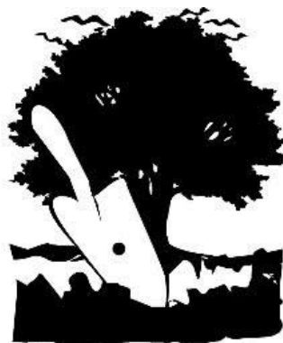
Mustard Seed Faith

Copyright © Sermons4Kids, Inc. May be reproduced for Ministry Use