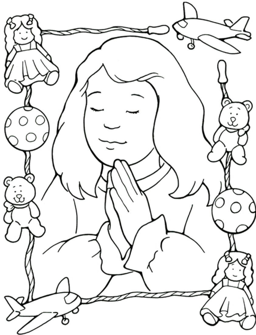
Keep on Praying

Each number represents a letter of the alphabet. Substitute the correct letter for the numbers to reveal the coded words.