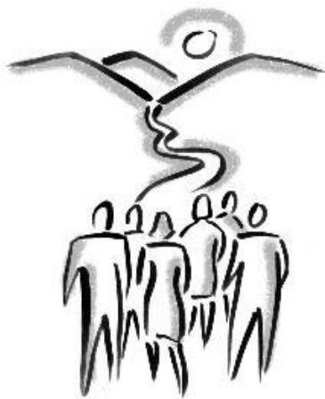
The Road to Emmaus