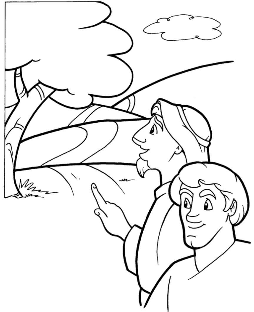
The Road to Emmaus